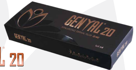
GENYAL ® 20 HYALURONIC DERMAL FILLER