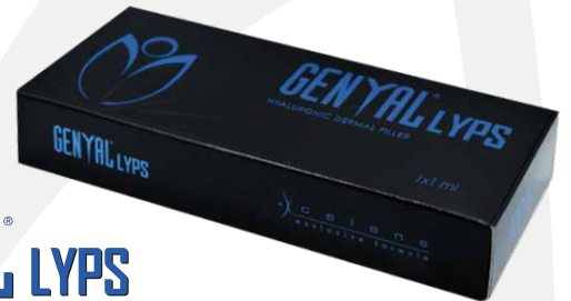
GENYAL ® LYPS HYALURONIC DERMAL FILLER