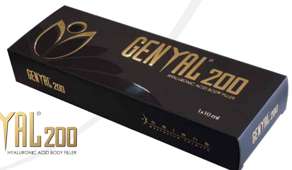
GENYAL ® 200 HYALURONIC ACID BODY FILLER