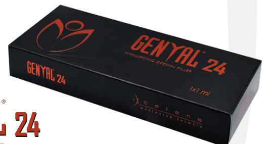
GENYAL ® 24 HYALURONIC DERMAL FILLER